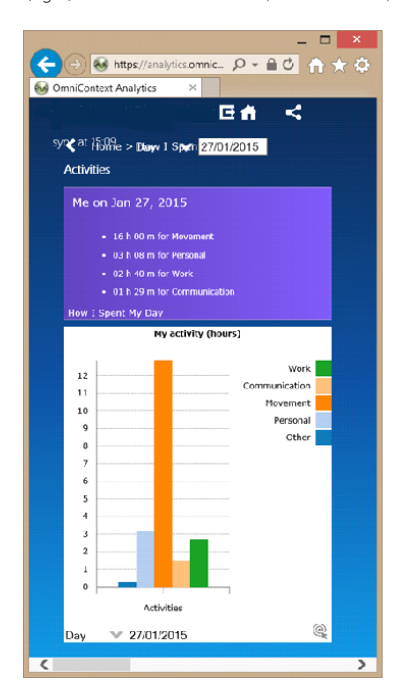
Figure 2: (left) HyperSoft screen capture showing email time spent time for personal, work, and communication activities. (right) Breakdown of mail sent, conversations, mail received

By mining information about the real use of the different business applications within the enterprise—in a sensitive and unobtrusive manner—you can realize savings for the department, company, and shareholders. By uncovering the real usage of applications, IT executives gain better insights into their users' needs and gain greater understanding of the economics involved. They also will be able to make more informed decisions regarding moving to cloud-based solutions and optimizing their investments in software applications and company headcount.