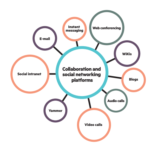
Figure 1: Your analytical tool must be able to monitor all applications and environments

On a larger scale, organizational analytics may also have a negative connotation with its bigger brother, Big Data. Being a father of four tech-savvy children who are gripped by the current Pokémon Go craze, I could suddenly see the future for big data, and it was immersive, immediate, and interesting.